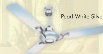
Pearl White Silver