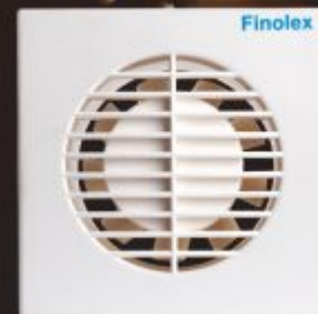
TABLE, PEDESTAL, WALL & EXHAUST FAN