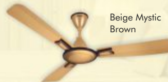
Beige Mystic Brown