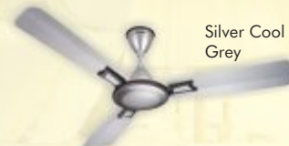
Silver Cool Grey