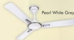
Pearl White Grey