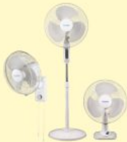
Hyve (HS & NS)